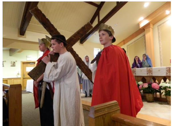
Students from Rev. Brown School prayed the Stations of the Cross on Good Friday.

To make an appointment please call 973-729-9174.